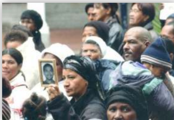
Unknown mother mourning her son, representing all the unknown victims of Prinsloo Guns .