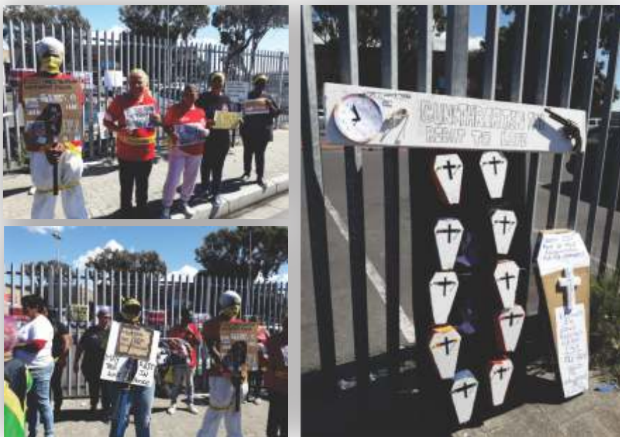
A 2023 protest outside the Mitchells Plain police station helped spotlight the role of the police in leaking guns into criminal hands.