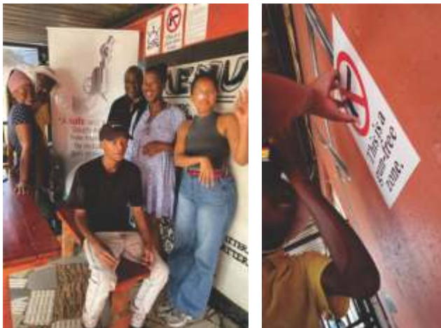
Patrons feel safer in groove spots and restaurants that are designated Gun Free Zones

In Gauteng the focus of GFSA's work in Alexandra, Ivory Park and Tembisa was on making groove spots and restaurants GFZs in recognition of the risks posed by the lethal mix of guns and alcohol to the community at large.