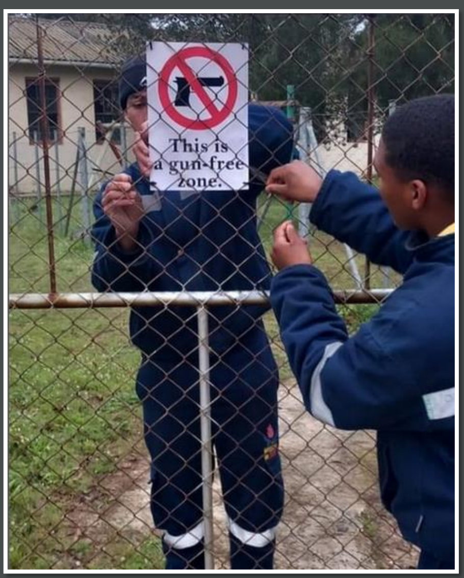
Working on Fire in Mamre declared a Gun Free Zone

GUN FREE ZONES ARE NOW VISIBLE ON GOOGLE MAPS